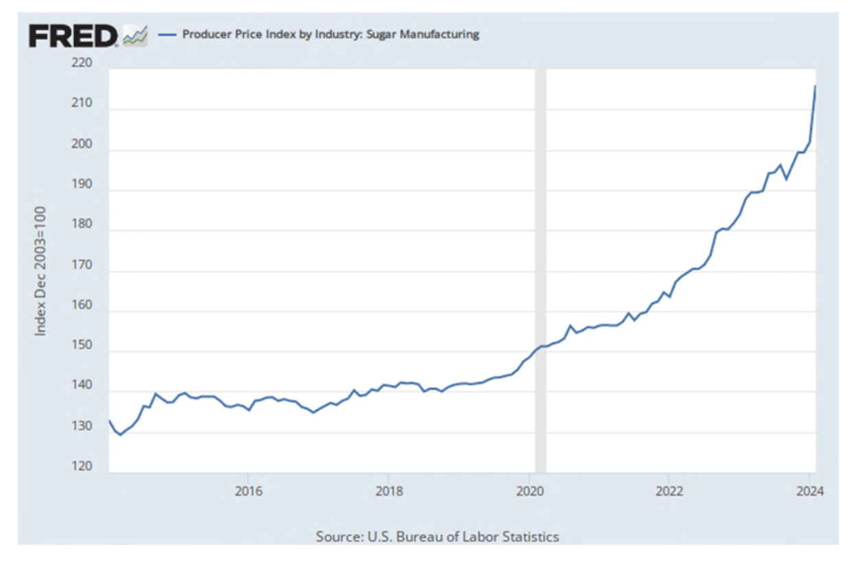
65. Commodity prices for sugar have also increased dramatically during the Class Period. The following is a chart showing commodity sugar prices in USD/lb for the last five years:

64. The following is a chart of the producer price index for the Sugar Manufacturing sector during the Class Period and the five years preceding it: